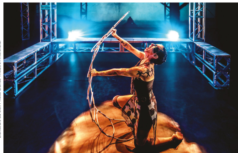
Danseurs du ciel.