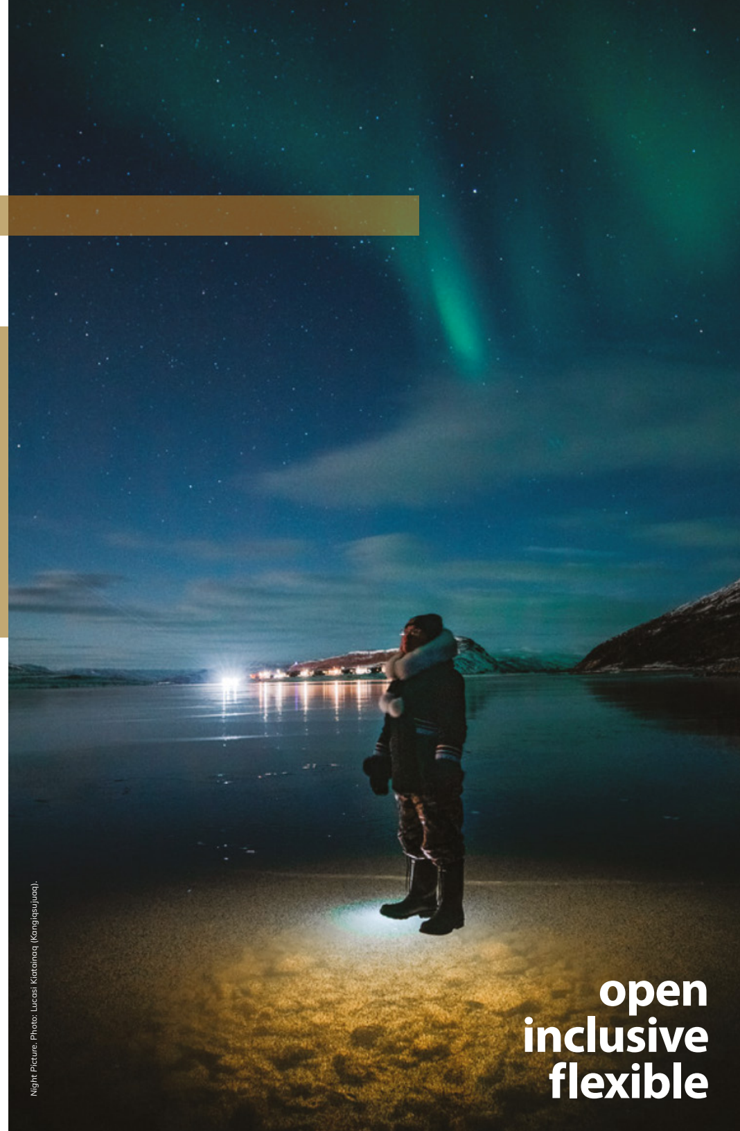
Night Picture.

Encourage the respect of Indigenous protocols.